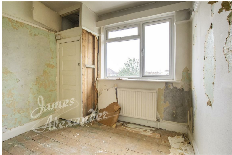
Rear of property